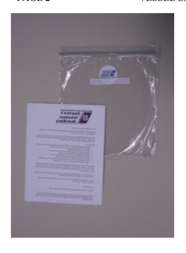
FIG. 1 FIG. 2