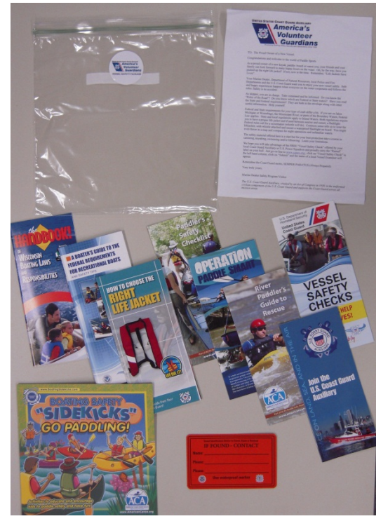
FIG. 3 FIG. 4